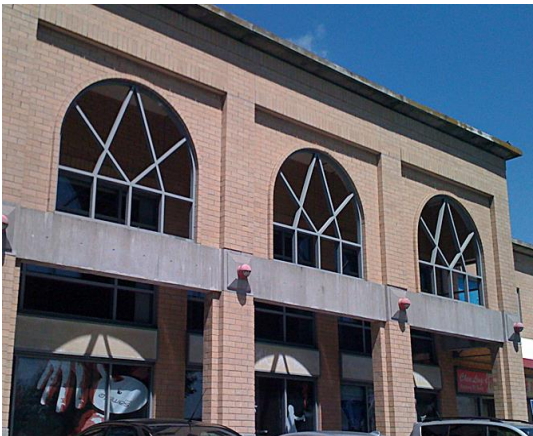
The mullions of this shopping centre entrance clearly depict the Masonic square and compasses. Continental Centre, Richmond, British Columbia, Canada.