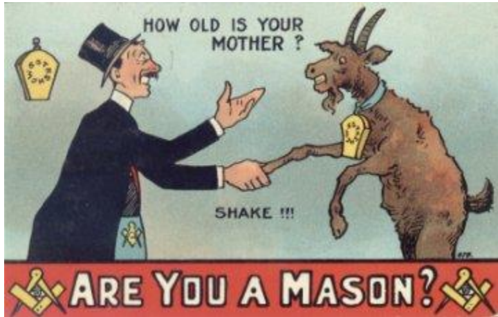
Masonic postcards were popular in the early 20 th century and came in a wide variety of topics related to the Masonic Lodge.