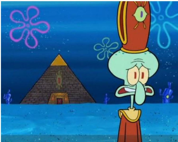
And finally, this cartoon cell from the world of animation.....'The Vigilant Citizen'. The only thing Squidward wants in the world is to be back in the Cephalopod Lodge, a secret society for fish with tentacles. This is not the first time a Sponge Bob cartoon refers to Freemasonry.