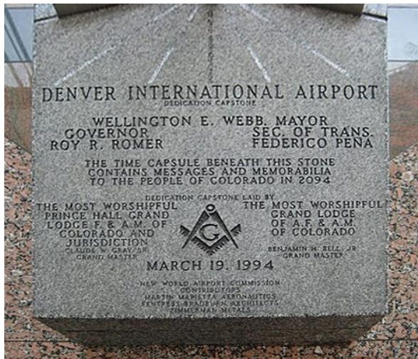
Relatively uncommon today, in the nineteenth and early twentieth century the local Freemasons were often asked to officiate at the cornerstone laying of public buildings. Notable for its rarity, this stone is not in fact a cornerstone but is the "capstone" for the Denver Airport in Colorado.