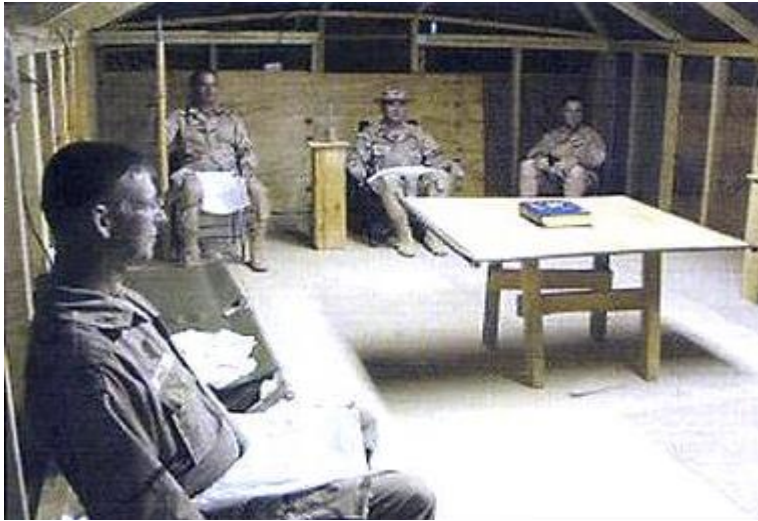
A view toward the East in Hiram Lodge's tiled tent somewhere in the Iraqi desert, a haven for US Freemasons...circa 2010