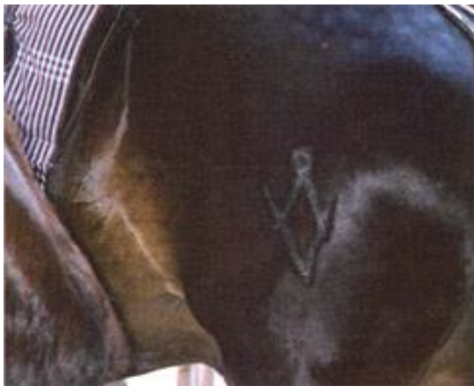
This horse brand was photographed in Seville, Spain and appeared in the Winter 2003 issue of Freemasonry Today .