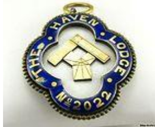
Collecting Masonic pins, badges, and jewels is still an active hobby today.