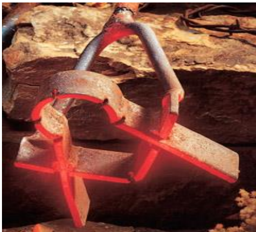
Matador Cattle Company's Beaverhead Ranch, in Montana, uses a Square and Compass brand. This ranch is owned by Koch Industries of Kansas.