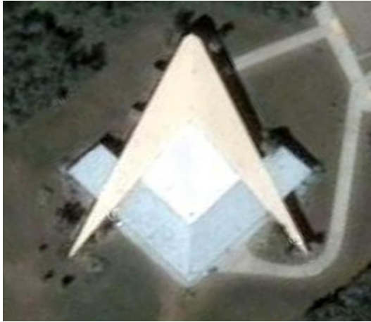
The 2,339-acre International Peace Garden, situated on the border between Manitoba and North Dakota, was dedicated in 1932. Jointly sponsored by the Grand Lodges of North Dakota and Manitoba, the Masonic Auditorium, was built in 1981.