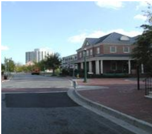
Freemason Street and Freemason Mews.