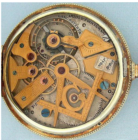
Masonic themed pocket watches were very popular from the 18 th century through the late 1950's. A limited edition Dudley pocket watch is a highly sought after item and usually commands a price of several thousand dollars.