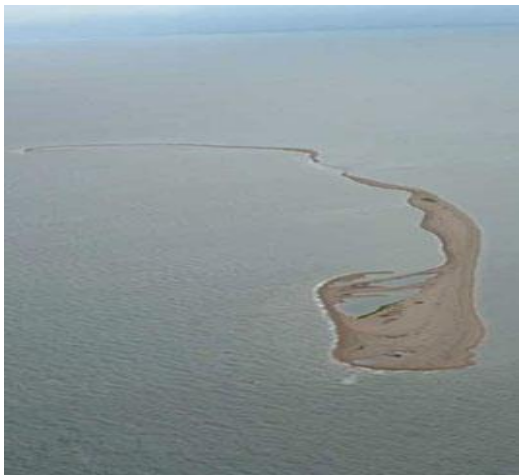
Freemason Island, a small island with a substrate composed of mollusk shell fragments, is the southernmost of the Chandelier chain of islands off the shore of St. Bernard County, Louisiana. It was a nesting spot for Reddish Egrets and Louisiana Herons until several freezes starting in 1962 killed off the Black Mangrove thickets. Hurricane Ivan swept the area with a maximum sustained winds of 132 mph in September of 2004, reducing the island to two small islets.