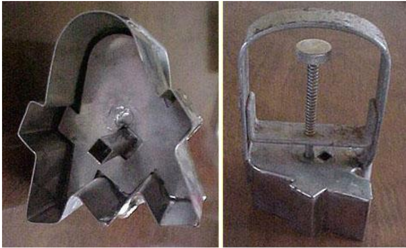
offered for sale on an internet auction in 2003.