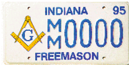
Masonic license plates have been issued by most of the states in the US and many foreign countries, and are quite collectible.