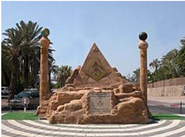
This Masonic monument was erected by Solomon's Pillars Lodge No. 59 in the traffic circle on Highway 90 at Izmagad, south of Eilat, Israel on the way to the Egyptian border .