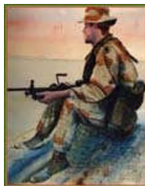
protecting our freedom.

© 2008-11 Tuckahoe Lodge – Graphics and text credits as noted.